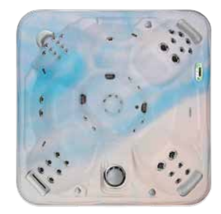
MARBLE, Wispy Blue