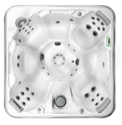
MARBLE, Silver Marble+