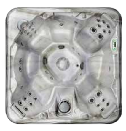
METALLIX**, Glacier Mountain+