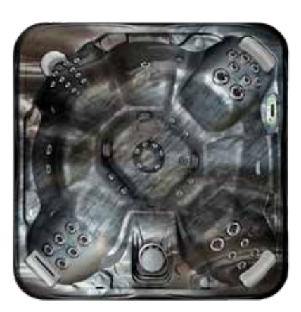
LUSTER SWIRL**, Midnight Canyon+

**Upgrade Colors | +965L Deluxe Available Color