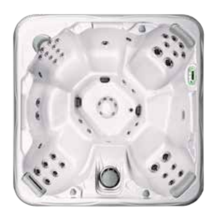
LUSTER**, White Pearl+