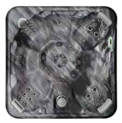
LUSTER SWIRL**, Storm Clouds